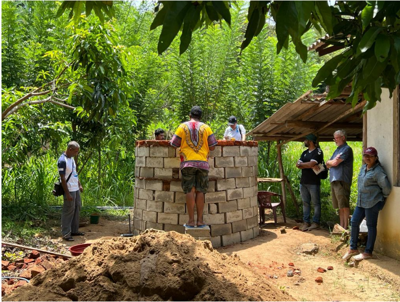
side wall with several layer of Ferrocement is going on