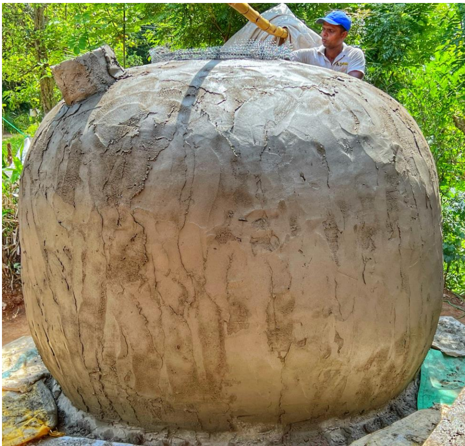
This pumpkin tank construction is of ferrocement. The cost of the tank is approximately SLR 15,000.