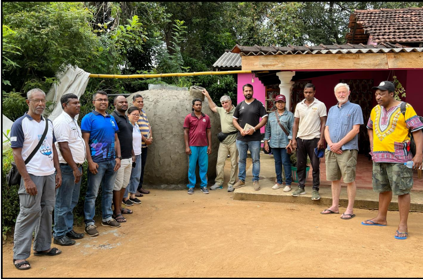
All trainers and implementation persons after layering