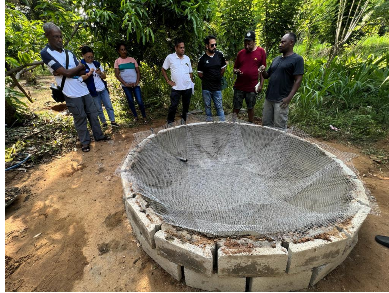
Chicken Mesh used for another Layer of ferrocement