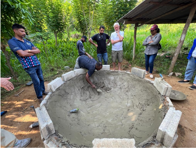
Base preparation of calabash Tank according to the design