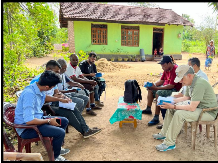
Team meeting for the details about the design