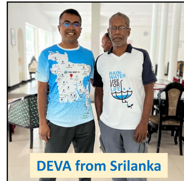
DEVA from Srilanka