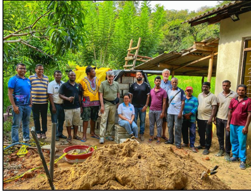
The team with all for the preparation of side wall