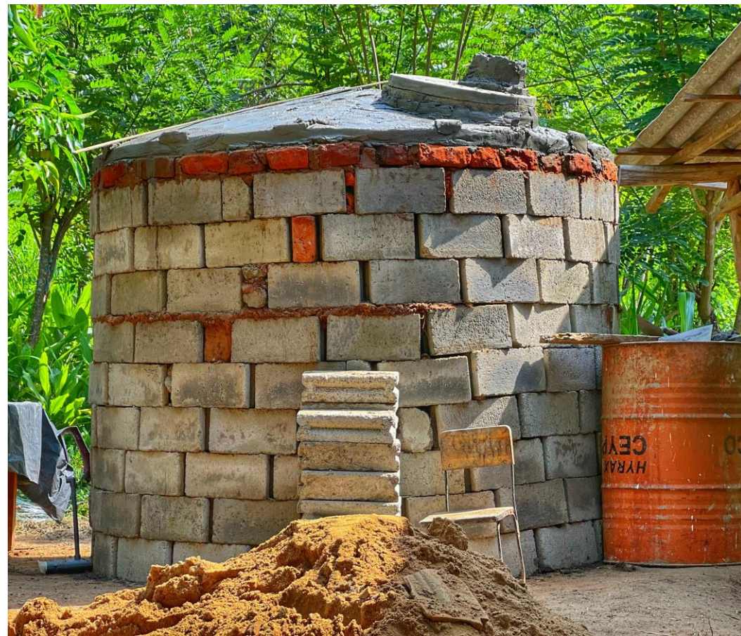
The Calabash tank is the optimised tank incorporating a long experience.