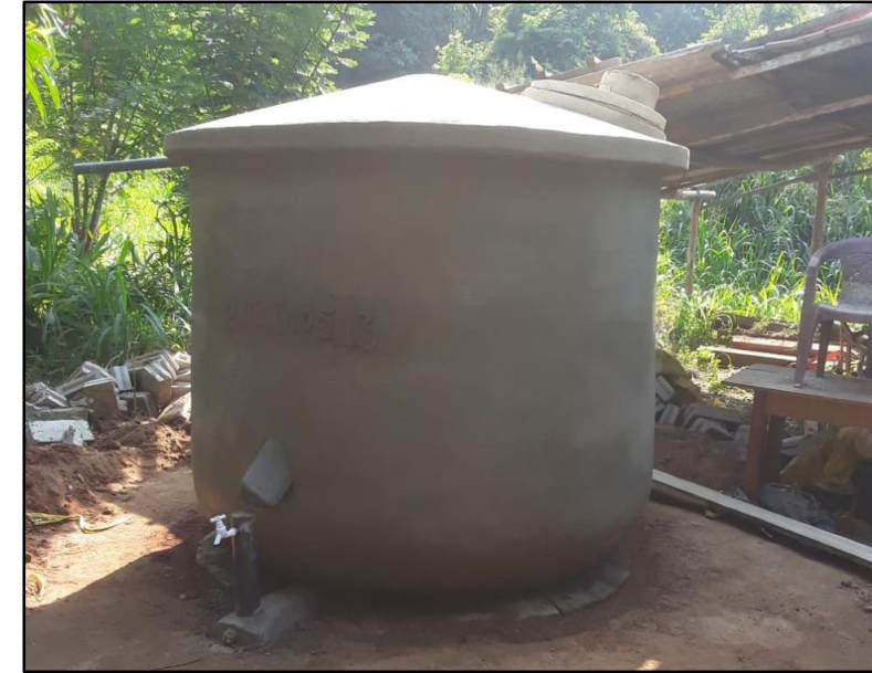
The final shape of the Calabash Tank