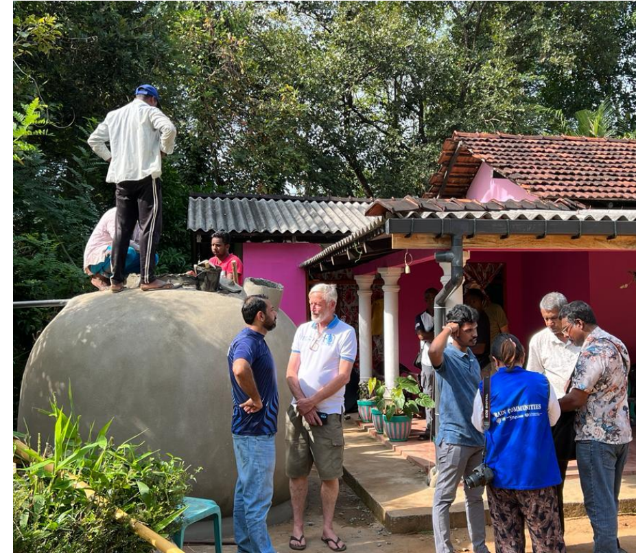
In depth knowledge for design and implementation