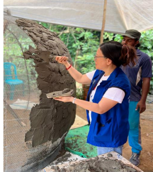
In hand practice of layering