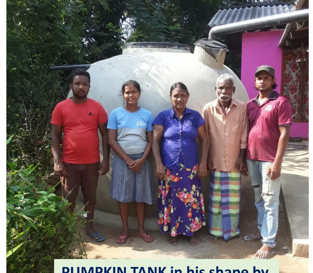
PUMPKIN TANK in his shape by SANET Training 8000L RWHS