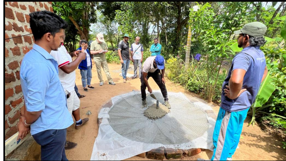
Base preparation with the appropriate design measurement