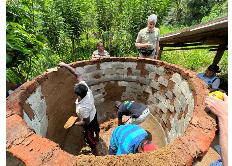
Sidewall preparation for Calabash Tank