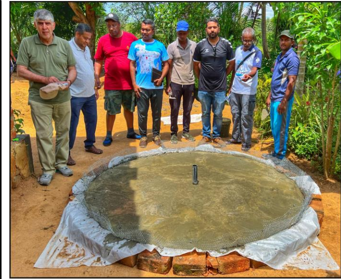
Finished base to keep as it is for curing